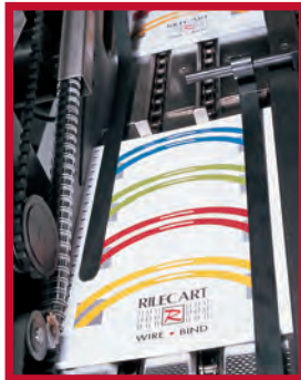
Wire feeding system.