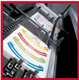
The wire out of tunnel reaches the binding area.