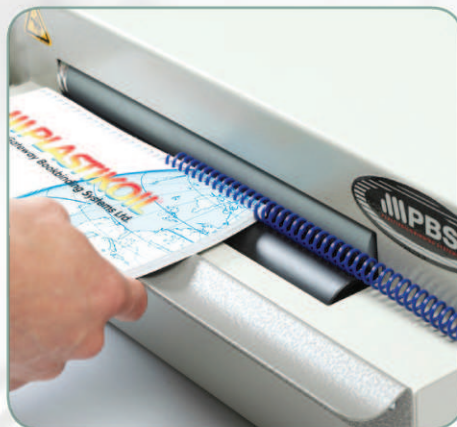
Dual spinning rollers provide quick and easy coil insertion.