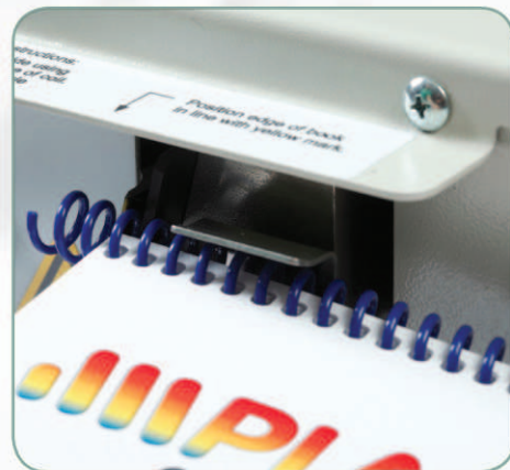
Gateway's TCB crimp technology – Simple dial adjustment to set up that offers consistent coil crimping.